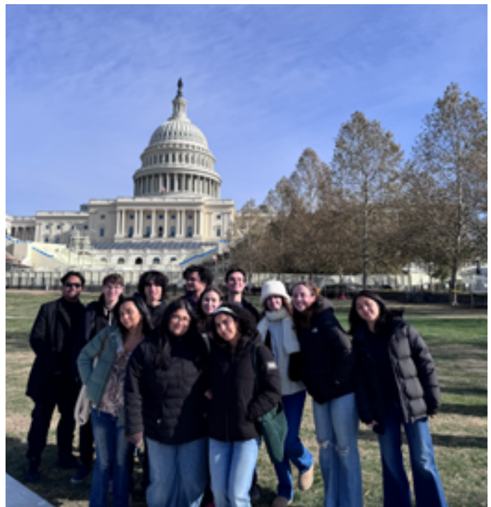
Political Science Society in DC

The final day of their trip was spent at the Museum of American History, rounding off their educational adventure before heading back to campus. The trip broadened their academic horizons and fostered camaraderie among the members, making it a truly unforgettable experience.