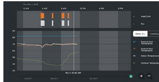
Power to make Decisions