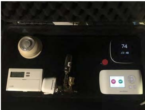
Energy Management Systems