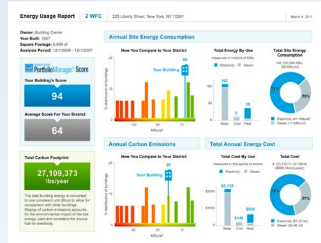
The EPA & The Clean Air Act